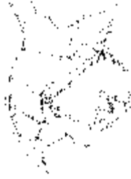
1773 plat of the area that became Jefferson Patterson Park

Click on images below to see larger version of image.