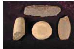
Indian artifacts found with the fireback in a trash pit

Funding for the 2018 JPPM Public Archaeology Program is provided by the Maryland Historical Trust Board of Trustees. Past sponsors include the Maryland Humanities Council, the Marpat Foundation, the Calvert County Board of Commissioners, Baltimore Gas & Electric Company, Black and Decker Corporation, the Eugene Chaney Foundation, the Friends of Jefferson Patterson Park & Museum, Inc., and an anonymous donor.