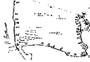
Plat detail showing area where Public Archeology will take place